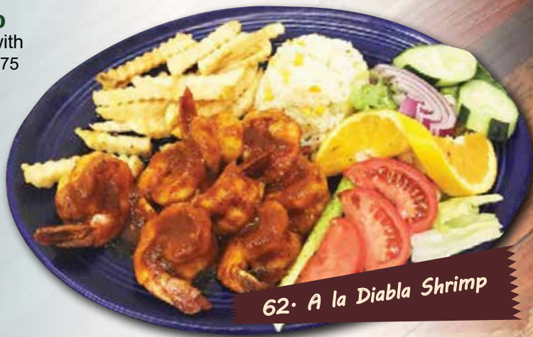
62. A la Diabla Shrimp