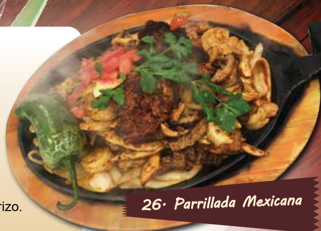
26• Parrillada Mexicana