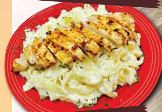
L. Chicken Alfredo Pasta

All take out orders, 25¢ extra per item.