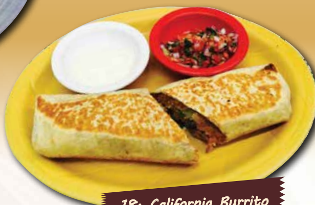
18. California Burrito

Grilled steak, chicken, shrimp, barbacoa, carnitas, pastor or chorizo. Filled with rice, onion, cilantro and cheese. Served with sour cream and pico de gallo – 11.50