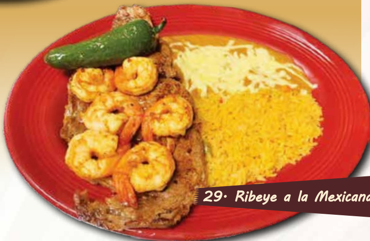
29• Ribeye a la Mexicana