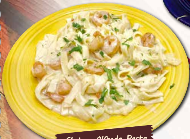
Shrimp Alfredo Pasta