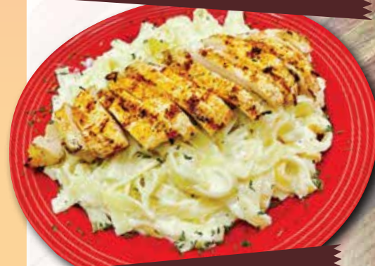
L. Chicken Alfredo Pasta

All take out orders, 25¢ extra per item.