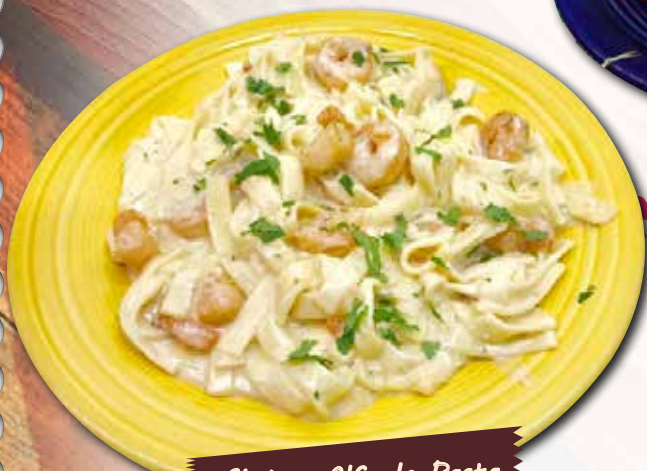
Shrimp Alfredo Pasta