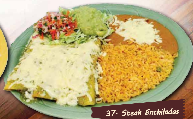
37• Steak Enchiladas