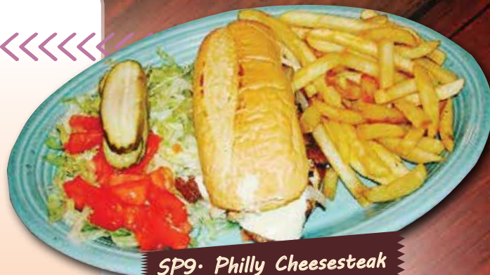
SP9. Philly Cheesesteak

Grilled chicken breast served with rice and beans – 8.95