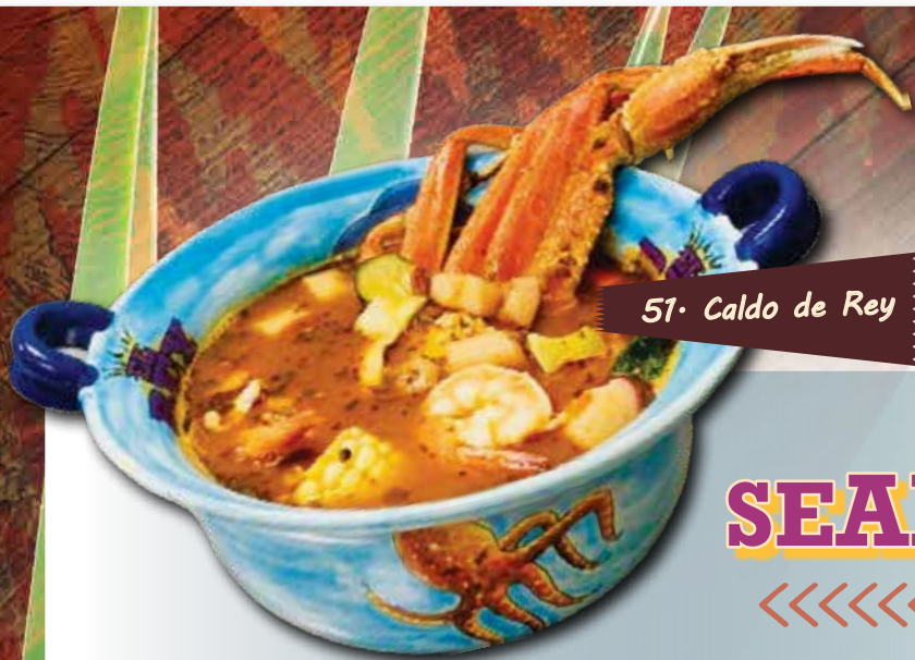
51. Caldo de Rey