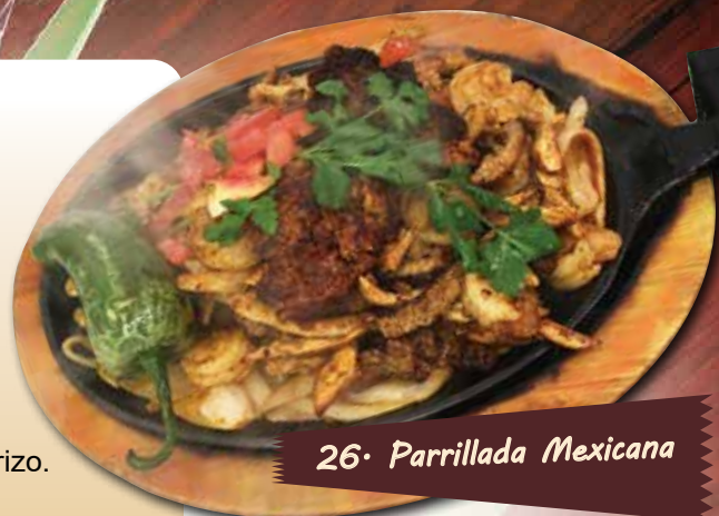
26• Parrillada Mexicana