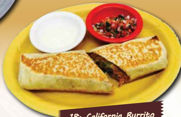
18. California Burrito

Grilled steak, chicken, shrimp, barbacoa, carnitas, pastor or chorizo. Filled with rice, onion, cilantro and cheese. Served with sour cream and pico de gallo – 11.50