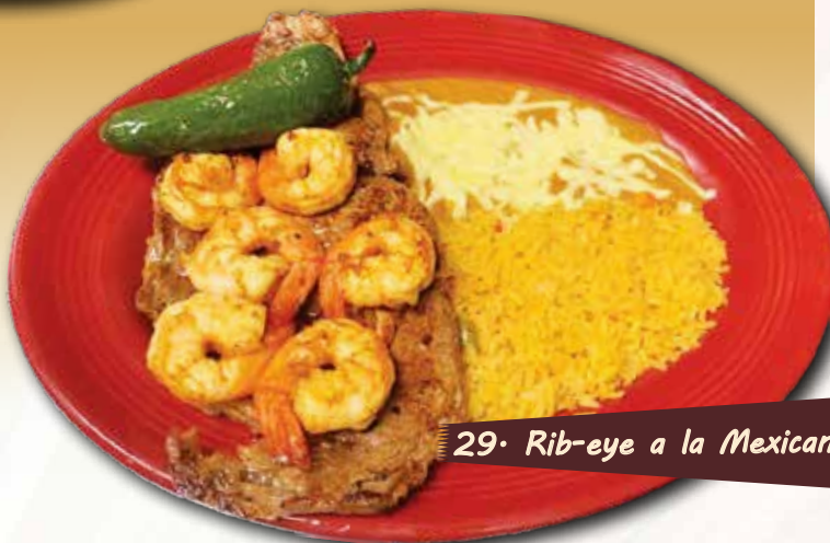
29• Rib-eye a la Mexicana