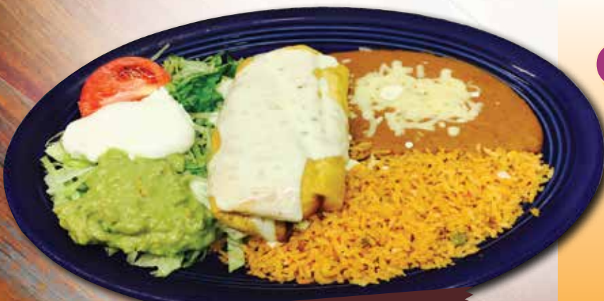
22. Fajita Chimichanga