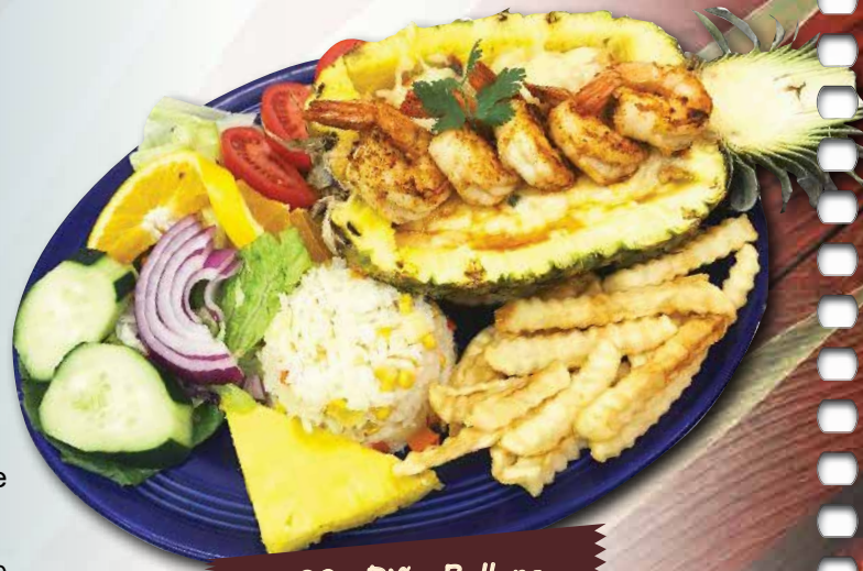
60. Piña Rellena