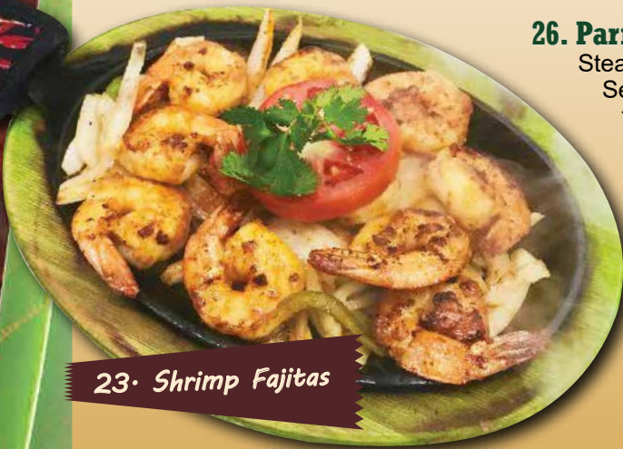
23• Shrimp Fajitas

Served with rice, beans, lettuce, tomatoes, sour cream, guacamole, pico de gallo and tortillas. Cooked with tomatoes, onions and bell peppers.