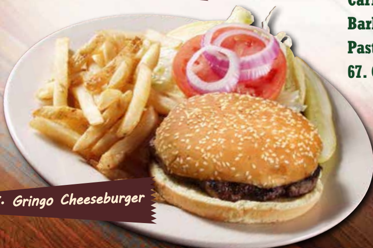
67. Gringo Cheeseburger