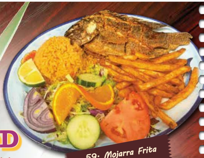
59. Mojarra Frita