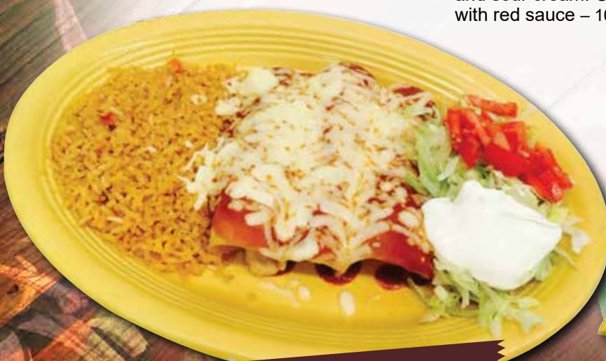
31• Enchiladas de Rancho

Three steak enchiladas covered in verde sauce. Served with rice, beans, lettuce, guacamole and pico de gallo – 11.50