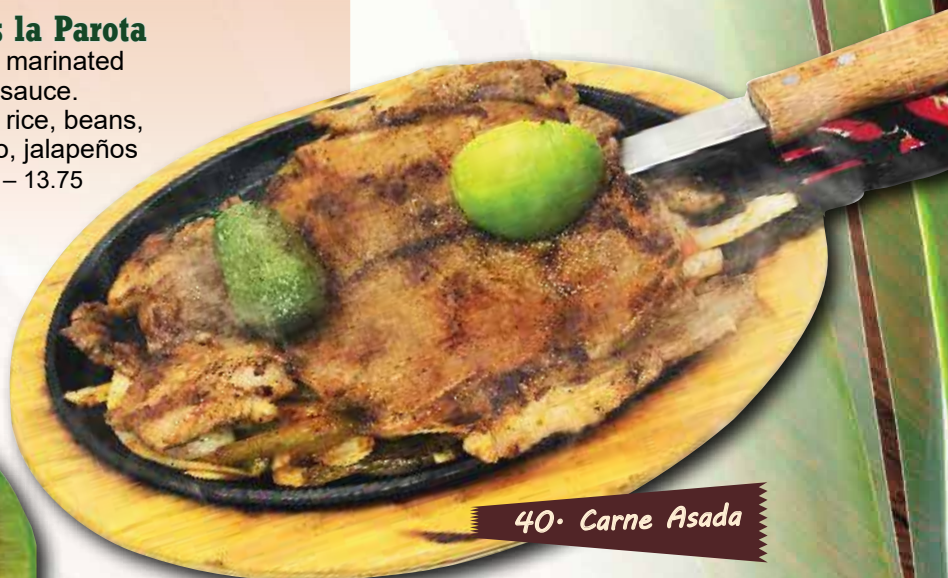
40. Carne Asada