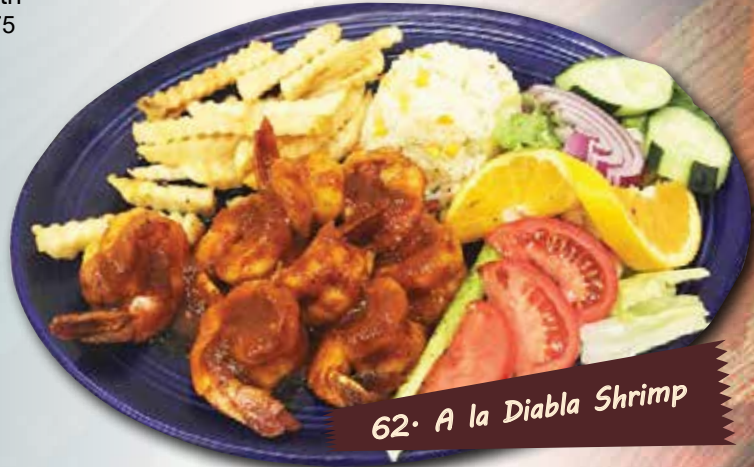
62. A la Diabla Shrimp