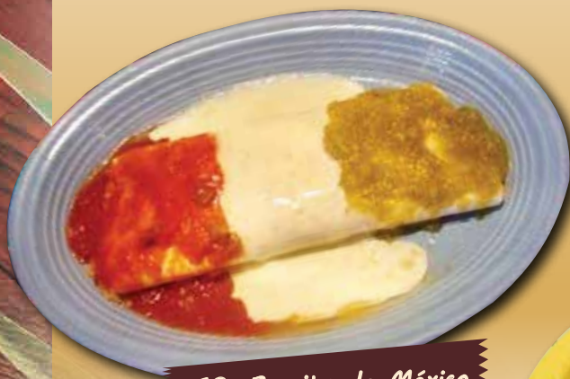
16. Burrito de México

Covered with red sauce – 4.95 Add cheese dip – 1.50