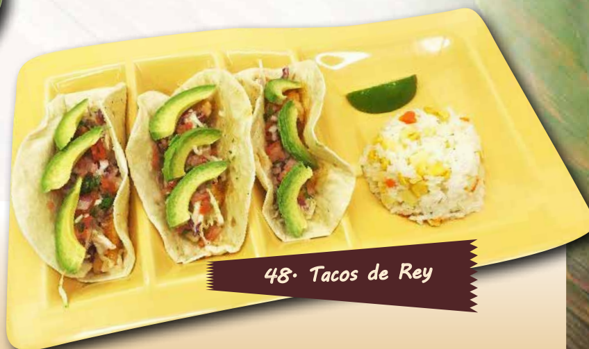
48. Tacos de Rey