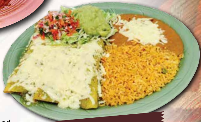
37• Steak Enchiladas

Served with French fries, a fresh house salad and dressing of your choice – 14.50