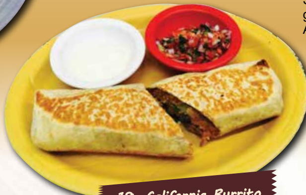
18. California Burrito

Grilled steak, chicken, shrimp, barbacoa, carnitas, pastor or chorizo. Filled with rice, onion, cilantro and cheese. Served with sour cream and pico de gallo – 11.50