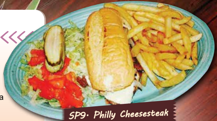
SP9. Philly Cheesesteak

One beef and bean burrito, one beef enchilada and one beef taco – 7.50