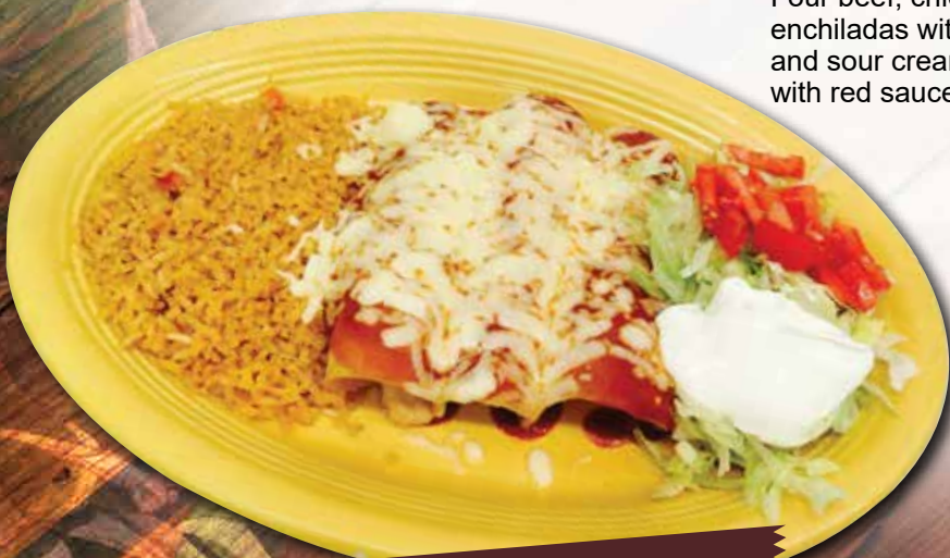
31• Enchiladas de Rancho

Three steak enchiladas covered in verde sauce. Served with rice, beans, lettuce, guacamole and pico de gallo – 11.50