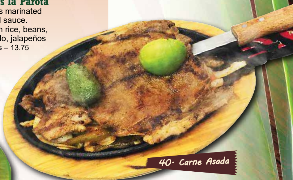
40. Carne Asada