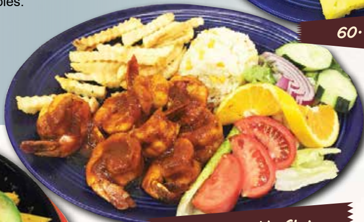
62• A la Diabla Shrimp