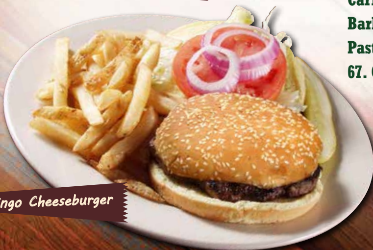
K. El Patrón