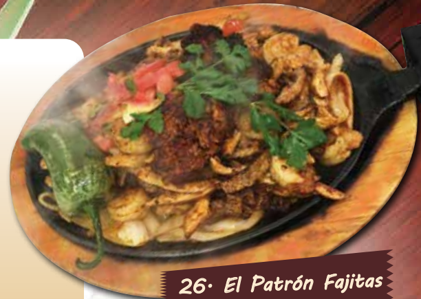
26• El Patrón Fajitas