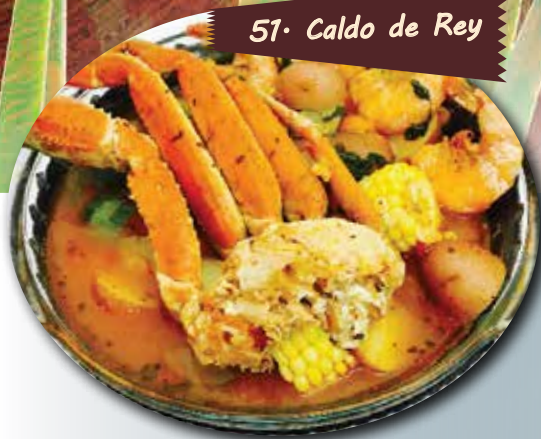
51• Caldo de Rey