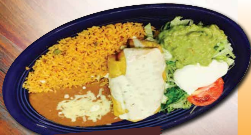
22. Fajita Chimichanga