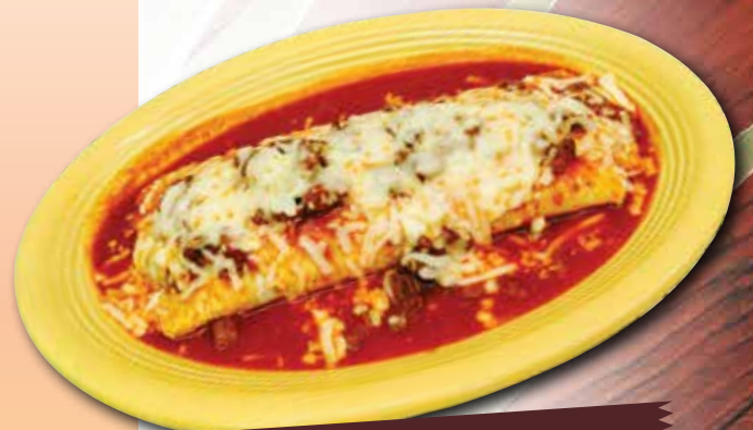
SP4. Hot and Spicy Burrito