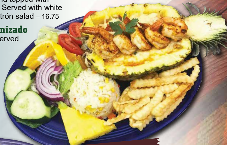
60• Piña Rellena

Choose from the following variety. Jumbo shrimp served with white rice, fries and a salad – 14.75