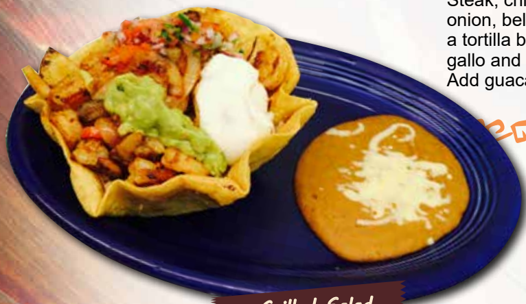
I. Rica Choice