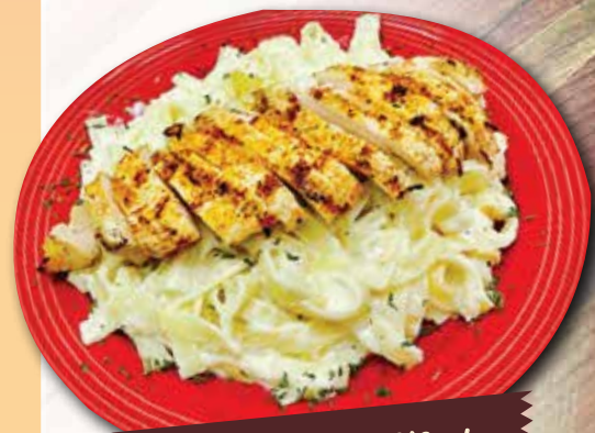
L. Chicken Alfredo Pasta

All take out orders, 25¢ extra per item.