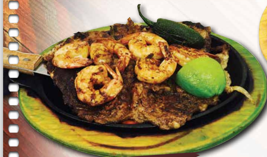
40. Carne Asada with Shrimp