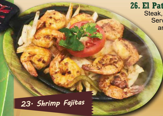
23• Shrimp Fajitas

Served with rice, beans, lettuce, tomatoes, sour cream, guacamole, pico de gallo and tortillas. Cooked with tomatoes, onions and bell peppers.