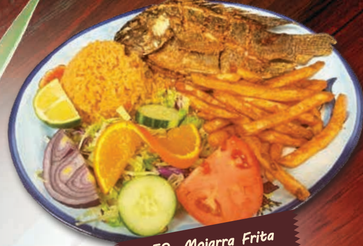
59. Mojarra Frita