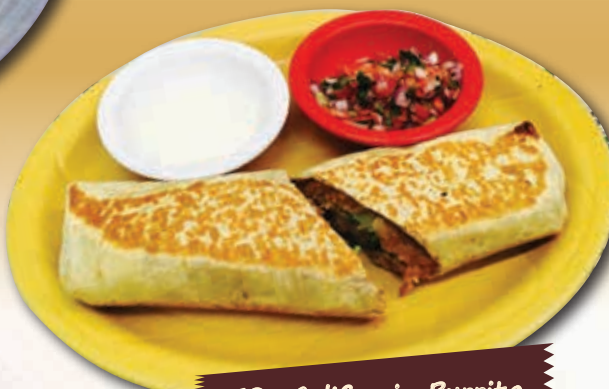
18. California Burrito