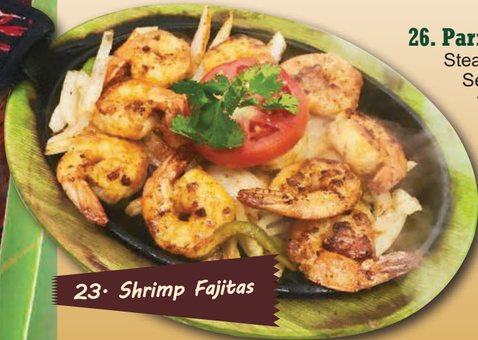
23. Shrimp Fajitas