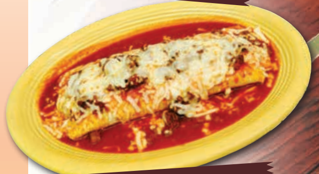
SP4. Hot and Spicy Burrito