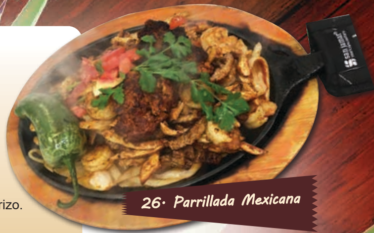
26. Parrillada Mexicana

Served with rice, beans, lettuce, tomatoes, sour cream, guacamole, pico de gallo and tortillas. Cooked with tomatoes, onions and bell peppers.