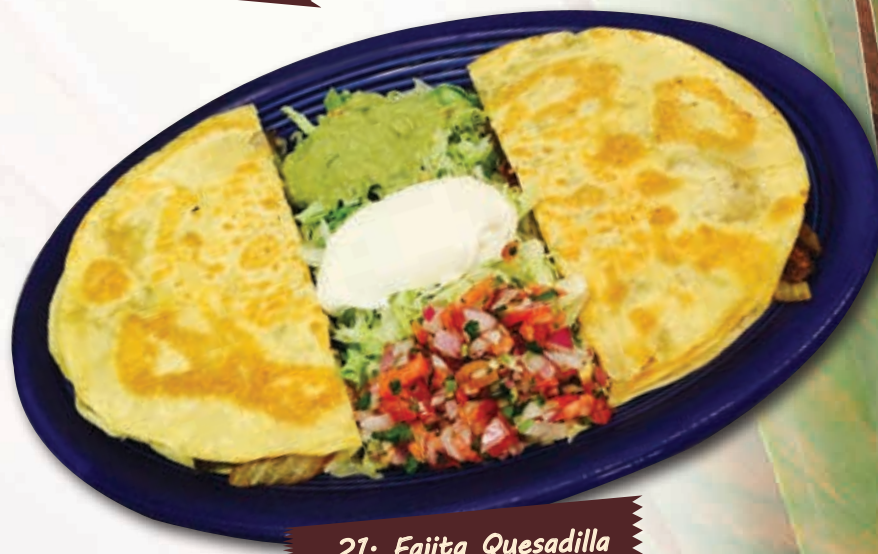
21. Fajita Quesadilla