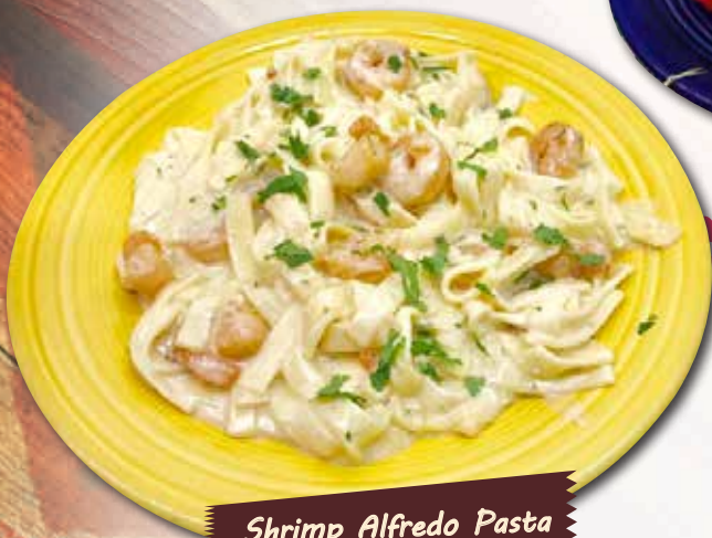
Shrimp Alfredo Pasta