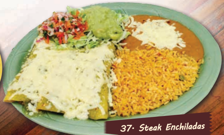
37. Steak Enchiladas