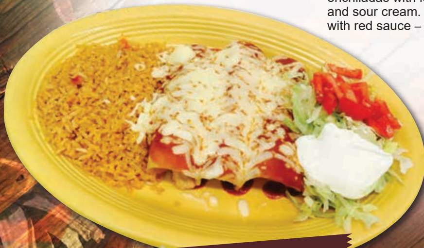
31. Enchiladas de Rancho

Three steak enchiladas covered in verde sauce. Served with rice, beans, lettuce, guacamole and pico de gallo – 16.95