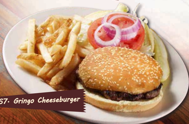
67. Gringo Cheeseburger

Torta Mexicana is a popular Mexican sandwich served on a warm bread with the choice of your meat: asada, pollo, carnitas, barbacoa, pastor or Jamón y queso. Filled with lettuce, tomatoes, onions, jalapeno, avocado and smeared with beans – 14.95