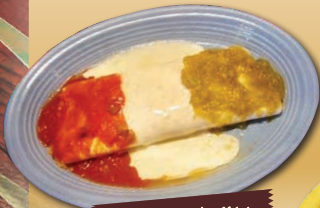
16. Burrito de México

Grilled steak, chicken, shrimp, barbacoa, carnitas, pastor or chorizo with corn, pico de gallo, lettuce, cheese, mild sauce and sour cream. Served with black beans and Spanish rice. Vegetarian includes guacamole – 13.95 Add guacamole or cheese dip – 1.95