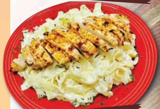
L. Chicken Alfredo Pasta

All take out orders, 25¢ extra per item.