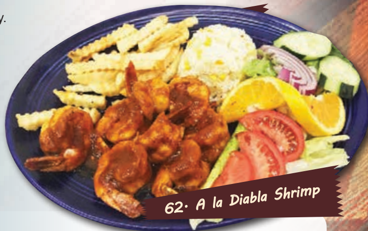
62. A la Diabla Shrimp