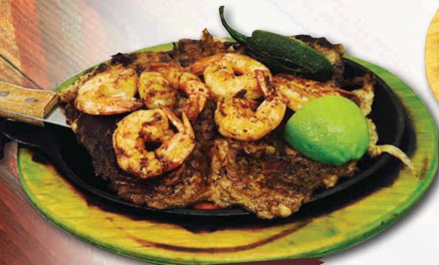
40. Carne Asada with Shrimp