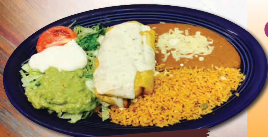
22. Fajita Chimichanga