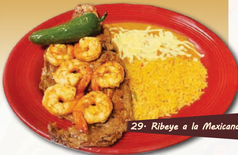
29. Ribeye a la Mexicana

Steak, chicken and shrimp. For One – 18.95 For Two – 32.95