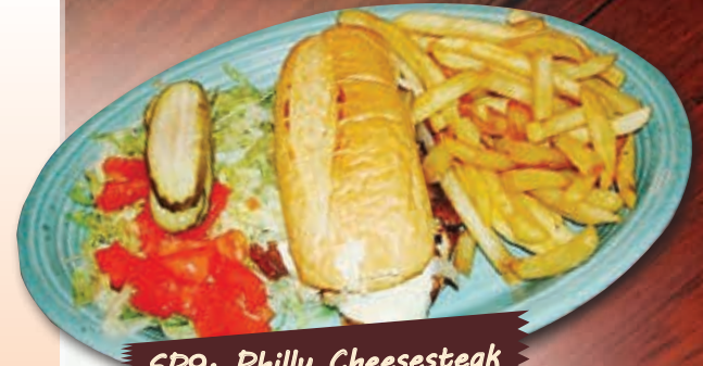
SP9. Philly Cheesesteak

One of the most beloved dishes in Mexico. Chilaquiles is a dish consisting of crispy tortillas that are covered in salsa, eggs and chicken. Topped crumbled cotija and served with rice and beans – 10.95