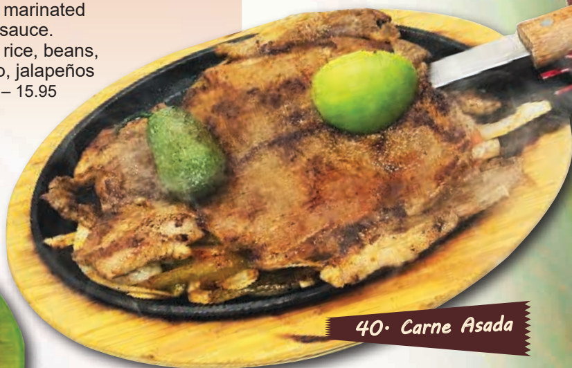
40. Carne Asada